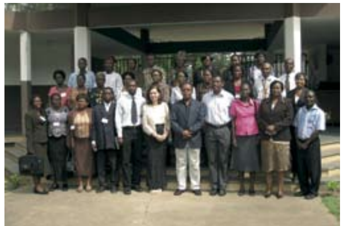
Group photo of participants and trainers, Ibadan, Nigeria.

It was agreed to have periodic monitoring, evaluation and boosting of the knowledge already acquired through scheduled visits to the participants in their respective institutions to observe them teaching their students using the skills acquired during the training.