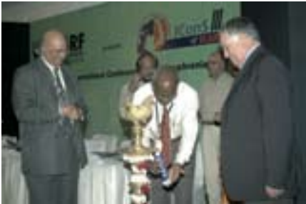
Inauguration of IConS 2008