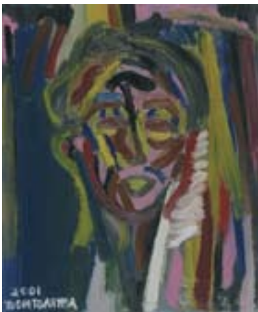
Y. A. (Japan), b. 1969, No title, oil on masonite, 45 x 38 cm.

Data of 126 patients discharged from hospital with the support of Sudachi-kai is as follows: the average length of hospital stay was 11.5 years and the longest was 42.2 years; 59 patients were in their fifties (46%) when the support started, 39 patients (31%) were in their forties and 17 patients (13%) were in their sixties. 65% were men, and the majority had schizophrenia (88%). Of the 126 patients, 61 (48%) were discharged to group homes, 48 (38%) to affiliated rooms rented by Sudachi-kai, 10 (8%) to private rooms and 7 (6%) went to other residential facilities. Of the discharged patients, 85 (68%) utilised Sudachi-kai's services, 12 (13%) terminated their use of services due to moving to other rooms or facilities, 10 (8%) had a hospital admission, 11 (9%) were deceased and 3 (2%) discontinued use of the services. The Sudachi-kai program has shown that many inpatients can be discharged and successfully live in the community if there is continuous support and a place to stay available on a 24 hour basis.