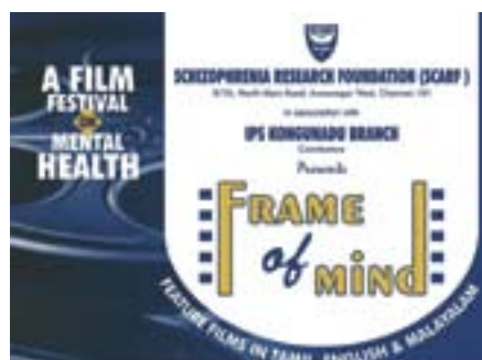
Frame of Mind - A film festival on mental health organized by SCARF

For more details, please visit our website: www.scarfindia.org