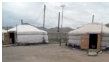
Tented and portable round houses (Gers) used in the Ger Project.

The Ger project successfully delivers psychosocial programs close to the patient's home at the district level. Key advantages include the low cost of the ger, its mobility and the reduction of stigma and discrimination through the involvement of the community and families. Advocacy at the government level is important for the sustainability of the project.