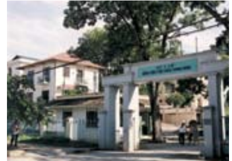
National Psychiatric Hospital No. 1, Vietnam.

national collaboration, and from 2008 to expand mental health care for children and older people. As there is currently only a small capacity to train mental health workers and social workers, there is a great need to build up the workforce to meet the needs of people with mental health problems.