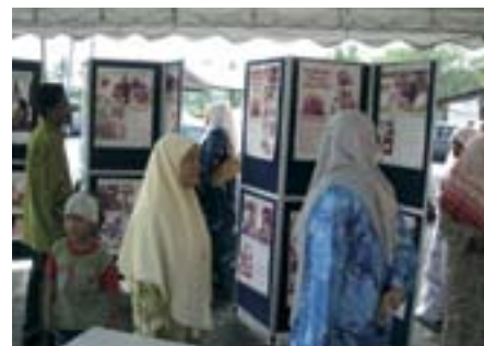
Community mental health education in Malaysia.

This service model is in line with plans to down-size the mental institution. Our strategies include: reduction of acute admissions by setting up small acute units with home-care services (e.g. resident psychiatrists at district hospitals); development of alternative appropriate residential facilities with varying levels of care (high-level support, low-level support, respite care and group homes); supported education and employment; and strengthening inter-sectoral collaboration between related agencies (such as social welfare, education, labour department), carers, and NGOs.