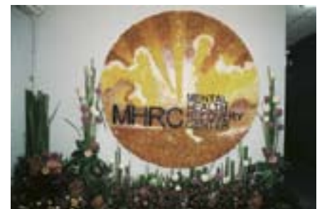
Mental Health Recovery Center, Thailand.

© 2008 Asia-Pacific Community Mental Health Development Project. A full country report can be found at www.aamh.edu.au .