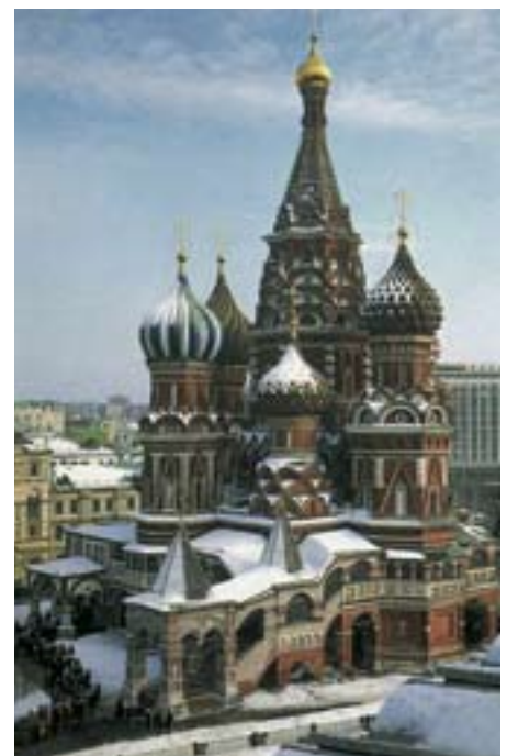
Saint Basil the Blessed.