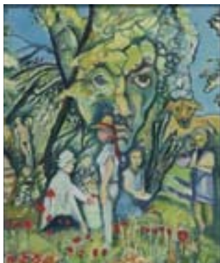
Graeme Doyle (Australia), No title, 1990, oil on masonite, 50.5 x 40.5 cm Artwork supplied courtesy of the Cunningham Dax Collection

From 2008, the HASI in the Home stage will increase to over 1,000 places across NSW.