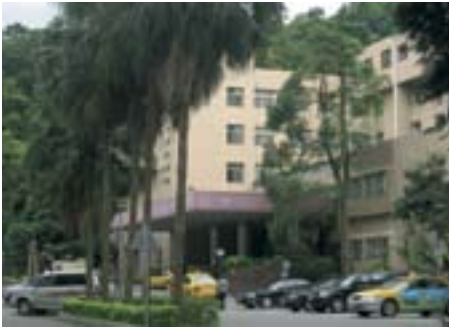
Taipei City Psychiatric Center.

© 2008 Asia-Pacific Community Mental Health Development Project. A full country report can be found at www.aamh.edu.au .