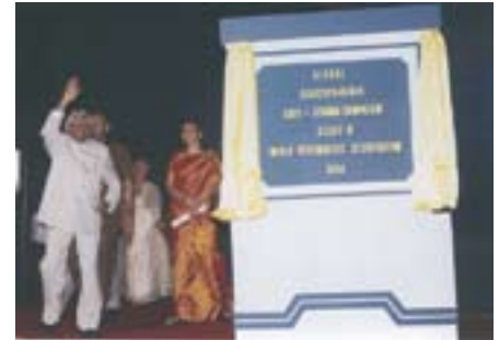
The President of India Dr. Abdul Kalam inaugurating the Anti-stigma program of SCARF

cupational therapy and Nursing. Students gain valuable experience in working with the chronic mentally ill, through SCARF's treatment and rehabilitation programs.