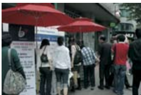
Promotion of SMMHC Mental health brand, "Blutouch", October 2007.

The model for organising the SMMHC has been adapted from St. Vincent's Mental Health in Melbourne, Australia, through a contract between Seoul and Melbourne. The SMMHC now has four teams: the Community Assessment and Linkage System (CALs), the Crisis Intervention Team (CIT), the Mental Health Promotion Team (MHPT) and the Homeless Mobile team (HM).