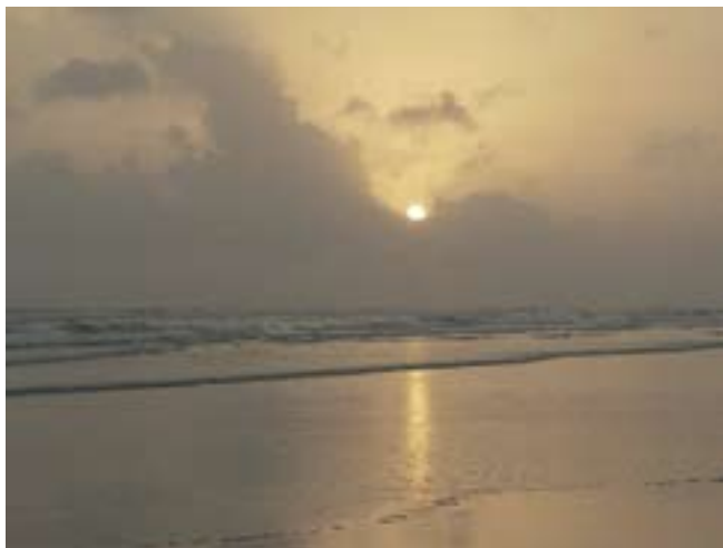
The Cox's Bazar sea beach, the longest sea beach in the world, and about 350 kilometers from Dhaka.

Community Mental Health: Goals and Challenges