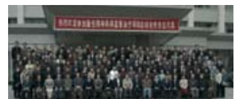
686 Annual Meeting in November 2006.

As a result of this program, more local officials pay attention to mental health issues and psychiatric hospitals now consider integrated prevention and comprehensive treatment. A community-based network has been established, led by the psychiatric hospitals, and supported by general hospitals and the CDC. Further, the program has benefited patients, particularly those of low-socioeconomic status, and has promoted social harmony.