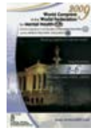
World Congress of Mental Health, Athens 2-6 September 2009

The study tours to facilities abroad constitute yet another initiative of the Association